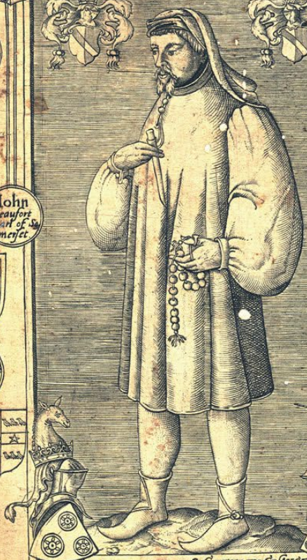
The true portraiture of GEFREY CHAUCER the famous English poet, as by THOMAS OCCLEUE is described who lived in his time, and was his Scholar.