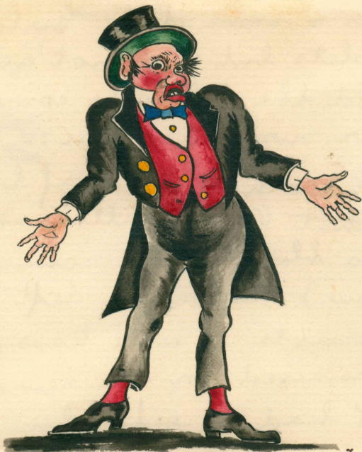
He still Waits his Reward.